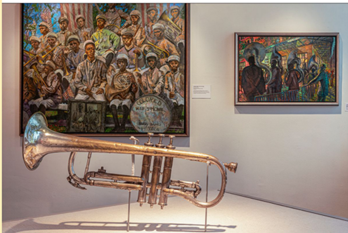
Rhys Room #1, June 2020.