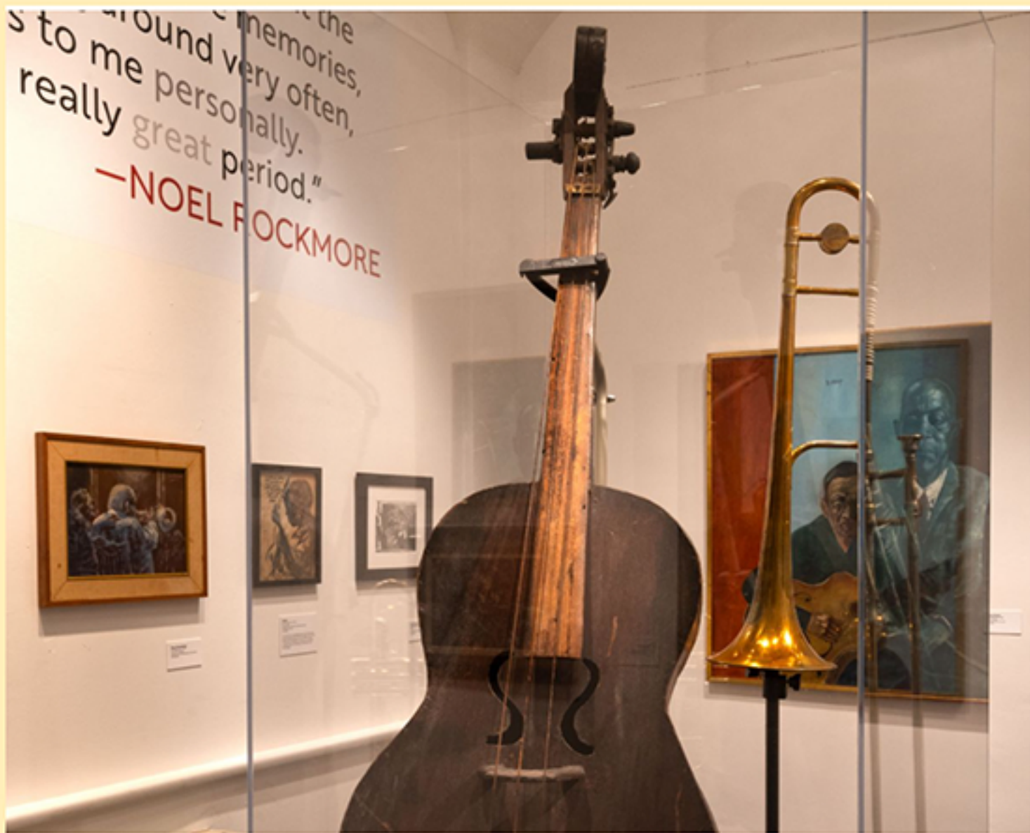
Rockmore Room #1, June 2020.