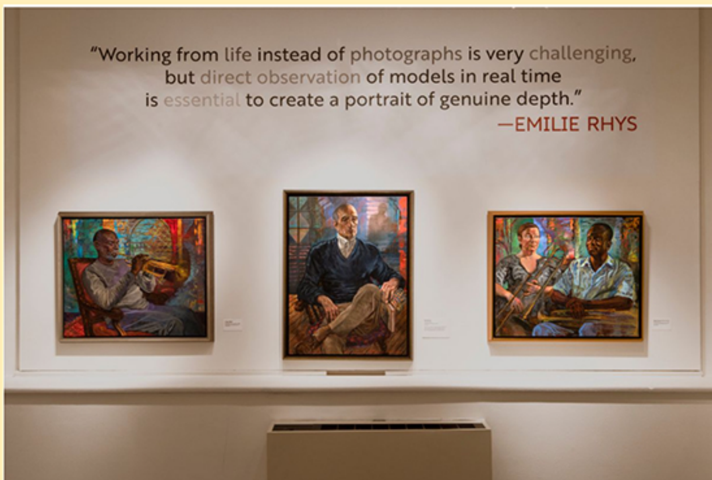
Rhys Room #2, June 2020.