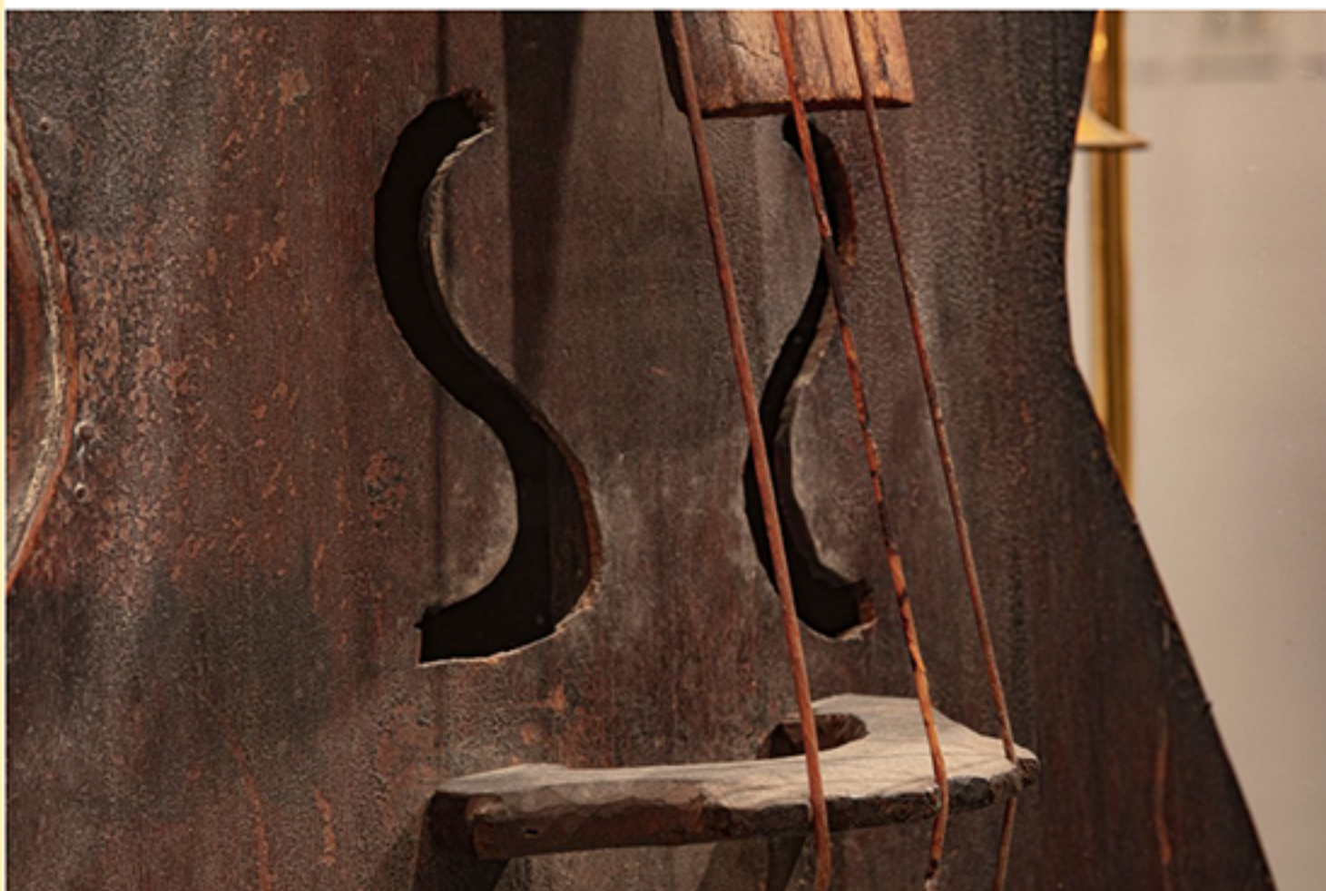
Detail, Alcide "Slow Drag" Pavageau's Bass. Hand-crafted by the musician circa 1927. Rockmore Room #1, June 2020.